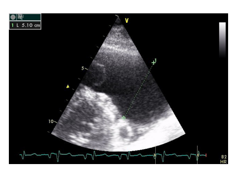
Figure 3. Echo (Modified Parasternal Short-Axis View) Indicating Bowing PV Leaflets and Dilated Main PA.

pulmonic valve has been discovered via modified parasternal short-axis view (Figure 4, Online video file 1) with severe PS but because of the associated chest deformity, Doppler alignment was not possible so peak velocity was underestimated (Online video file 2, Figure 5).