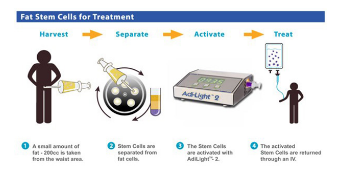
Figure 1. Adipose Stem Cells Processing (Adistem).

recombinant FSH (Gonal F, Merck/Serono). A testicular biopsy was scheduled for 3 months later.