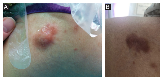
Figure 3. (A) keloid resulted from Acne vulgaris on shoulder before treatment. (B) same keloid after 6 session treatment by intralesional 5-FU. Hyperpigmentation due to 5-FU is notable.

Explicit change in scar volume was noticed after the first session in the cryotherapy group and after the sixth session in the steroid and 5-FU groups (Tables 1 and 2).