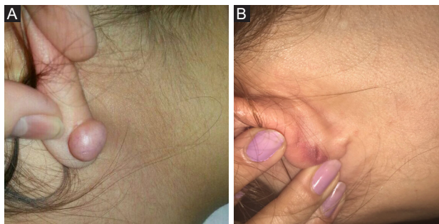
Figure 5. (A) Ear lobe keloid induced after piercing. (B) After one session cryotherapy the keloid is flattened.