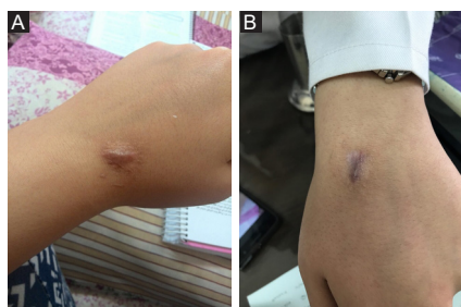
Figure 2. (A) Hypertrophic scar before treatment. (B) flattened scar after 3 session intralesional Triamcinolone therapy. Hypopigmentation is one of the steroid complication.

Comparison of the means of scar height and surface area in the 3 groups showed that the original size of scars in the cryotherapy group was larger than that in the other 2 groups. However, after the first therapy session, the size in this group was smaller than that in other groups; therefore, results showed a remarkable reduction in scar surface area in the cryotherapy than the other 2 groups.