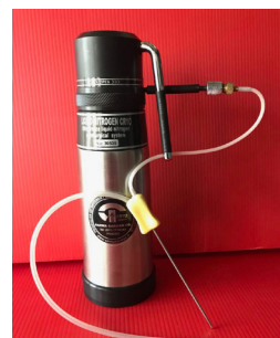
Figure 1. Cryoneedle for intralesional freezing.

A total of 63 scars were examined in this study on 33 patients including 20 women, 13 men (13 patients with 2 scars, 12 with 1 scar, 7 with 3 scars and 1 with 4 scars). Patients aged 20-52 years. Of the scars under study, 52 were keloid ranging from 8-month to 2-year scars and 11 were hypertrophic ranging from 4-month to 10-month scars. Ten scars were located on retroauricular region, 36 on torso, 11 on upper limb, 3 on lower limb, 2 on neck and 1 scar was located on the face.