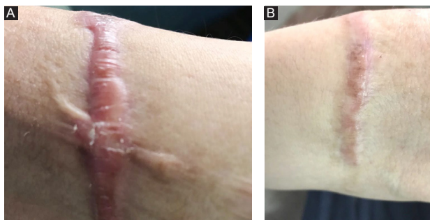
Figure 6. (A) keloid on forearm before treatment by cryosurgery. (B) Notable reduction in keloid size after one session cryosurgery.

In one study by Khan et al in 2014, 150 patients were divided into 2 groups of TAC therapy alone and TAC/5-FU combination therapy. Results showed that in the TAC alone group, recovery was 68% and in the TAC/5-FU group recovery was 84%. In the former group, 24% of the cases showed side effects and in the latter group, side effects were reported in 8% of the cases. Results of the same study showed that TAC/5-FU combination had better outcomes for keloid treatment (18).