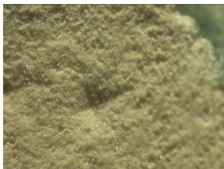
Figure 1. The Effect of the Indenter on a Gray MTA Sample Under a Microscope.

The results of independent t-test showed that the microhardness values of white and gray MTA on the first day were 53.7 and 43.6, respectively, with a significantly higher microhardness of white MTA (WMTA) compared to grey MTA (GMTA) ( P < 0.05 ).