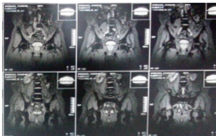
Figure 3. MRI Image After the Treatment. Note. MRI: Magnetic resonance imaging.

bone is disrupted for some reason. This can be similar to some kinds of gangrene since their clinical symptoms are somehow similar. The primary treatment of the disorder in traditional medicine is phlebotomy aiming at the quick decrease of the disrupting substance or humor and then massaging. Iranian traditional medicine holds that massaging has various favorable effects in the improvement of blood supplying to a specific organ (20). In a study by Amini et al, it was found that Fasd (phlebotomy) is as an effective method for the treatment of articulation pains and sciatica (18). The obtained results from previous studies confirmed the positive effect of Fasd on the musculoskeletal disease (21, 22).