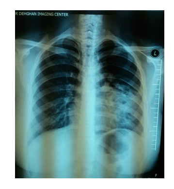
Figure 1. Chest X-ray displaying an opacity in the superior lobe of the left lung before the operation compared to the chest X-ray after the operation.

The patient was followed- up after the operation. During the follow-up session, she had abdominal pain two years after the thoracotomy. Further, an ovarian