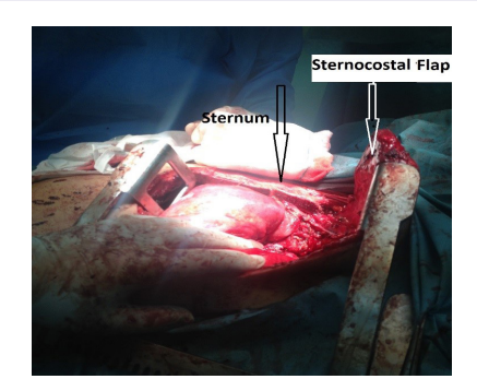
Figure 4. Left medial sternothoracotomy incision (hemi clamshell). Black arrow displays sternal longitudinal division site while white arrow illustrates left 5th intercostal space incision.