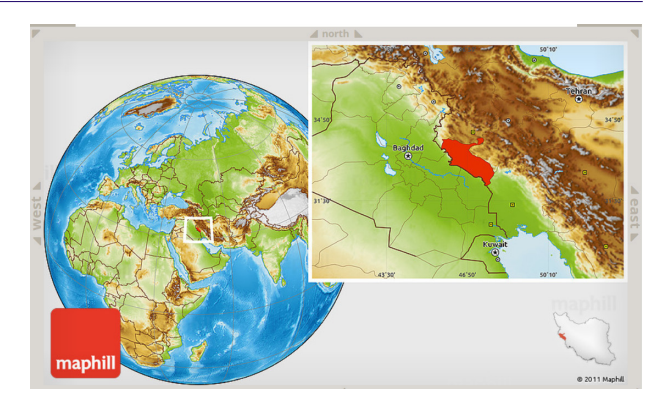
Figure 1. Physical Map of Ilam.

The mean serum 25OHD concentration of all participants was 27.02±18.04 ng/mL. Serum 25OHD concentrations based on age and sex are shown in Table 2.